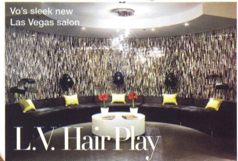
Vo's sleek new Las Vegas salon