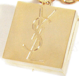
Clip the YSL mini charms and chain onto your YSL Tribute bag